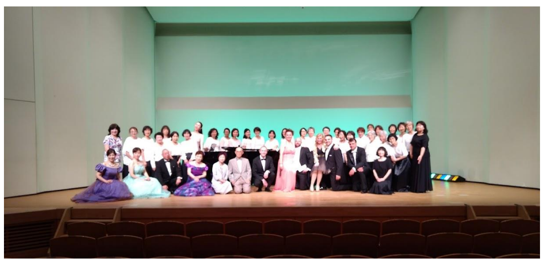
Workshop Opera Operetta Fukushima- the Final concert